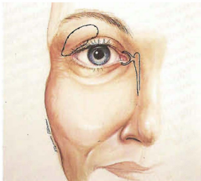
Tear drainage system.

This breakdown results in dry spots in the cornea, causing the symptoms associated with Dry Eye Syndrome—grittiness, burning, itchiness and general discomfort of the eye.